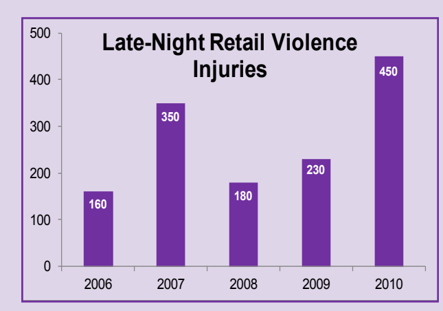
Between 2006 and 2010, injuries from late-night retail violence has nearly tripled (Source Bureau of Labor Statistics' Survey of Occupational Injuries and Illnesses).